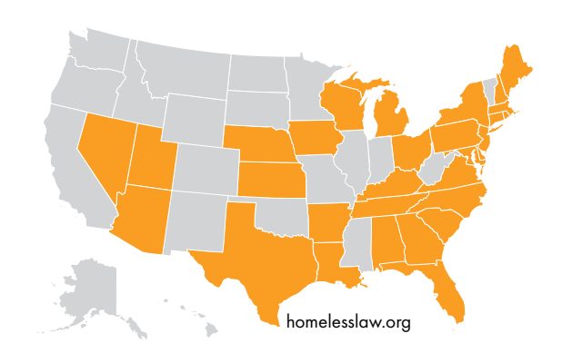
32 states criminalize loitering, loafing, or vagrancy

Our research found that sixteen states have laws restricting loitering, loafing, or vagrancy state-wide,<sup>32</sup> and twenty-four states have that restrict these behaviors in particular public places.<sup>33</sup> These statutes criminalize different behaviors and are subject to different penalties. Many of these restrictions overlap with other behaviors related to homelessness. For example, in Alabama, a person who "loiters, remains, or wanders about in a public place for the purpose of begging" has committed "the crime of loitering" in the state. 34 This statute essentially designates panhandling as a loitering offense. In Maryland, staying in a public building or on public grounds during regularly closed hours constitutes loitering.<sup>35</sup> Though it does not specifically say "camping," this loitering statute essentially prohibits camping.