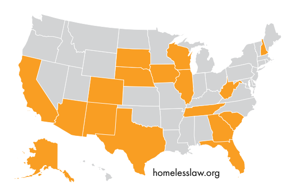
17 states criminalize camping in public places

Camping bans are frequently enforced as an excuse to conduct sweeps of homeless encampments. These sweeps can result in arrests and the destruction of a person's personal property, including IDs and personal documents, medicine and medical devices, and other crucial items.<sup>3</sup> Enforcement of a camping ban does not suddenly result in a person experiencing homelessness having a place to live. Instead, it unnecessarily displaces a person experiencing homelessness to another public place, where they might find themselves at risk of subsequent enforcement.