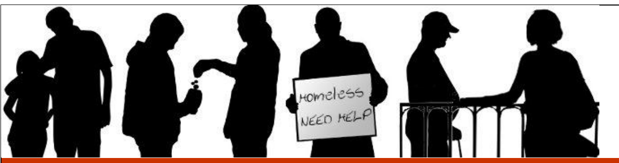
Changing Laws, Changing Lives

NATIONAL LAW CENTER ON HOMELESSNESS & POVERTY