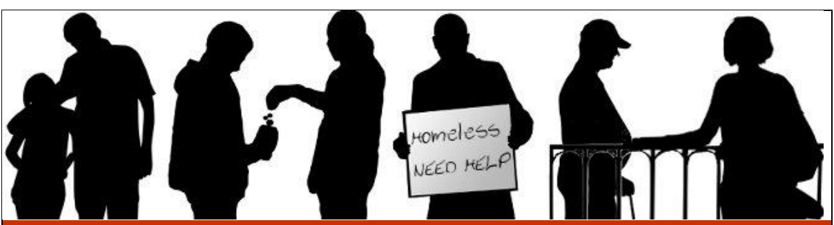
Changing Laws, Changing Lives